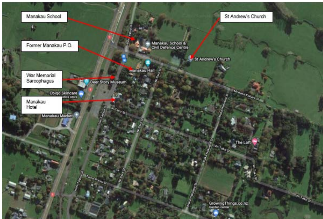
Figure M.1: Locations of listed and non-listed heritage items within Manakau PROJECT SHAPING AND AVOIDING AND MINIMISING EFFECTS

37. Key decisions to avoid or minimise adverse effects on pre-1900 structures were made during the consideration of corridor / route options for the Ō2NL Project, including as part of the MCA process. Insite Archaeology provided initial advice on pre-1900 structures resulting in "Ashleigh" being avoided in the preferred Ō2NL Project alignment. The proposed designations have avoided any significant effects on statutorily recognised built heritage items as well as non-statutorily recognised built heritage items (this is explained below).