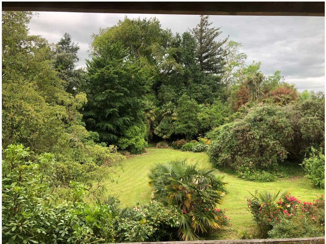
Figure M.3 View to the north from first floor of "Ashleigh" showing density of planting surrounding the house, photo Ian Bowman, 20 October 2020