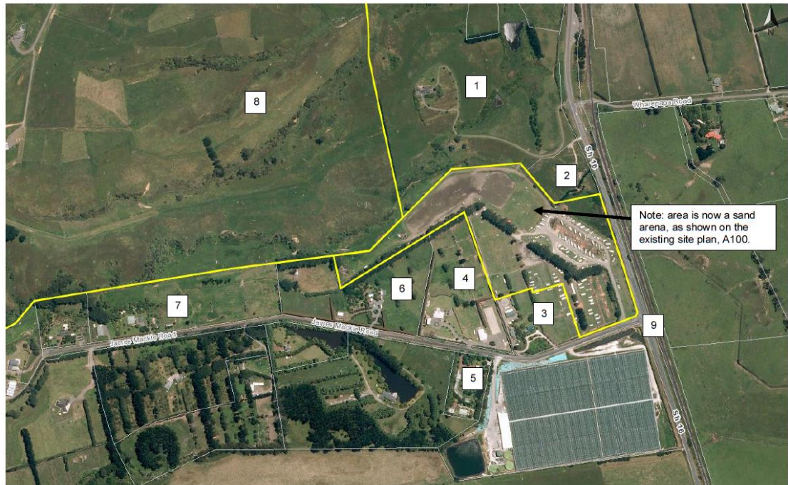
Aerial photo with party ID nos from Mr Keyte's evidence - Annexure B Locality Plan